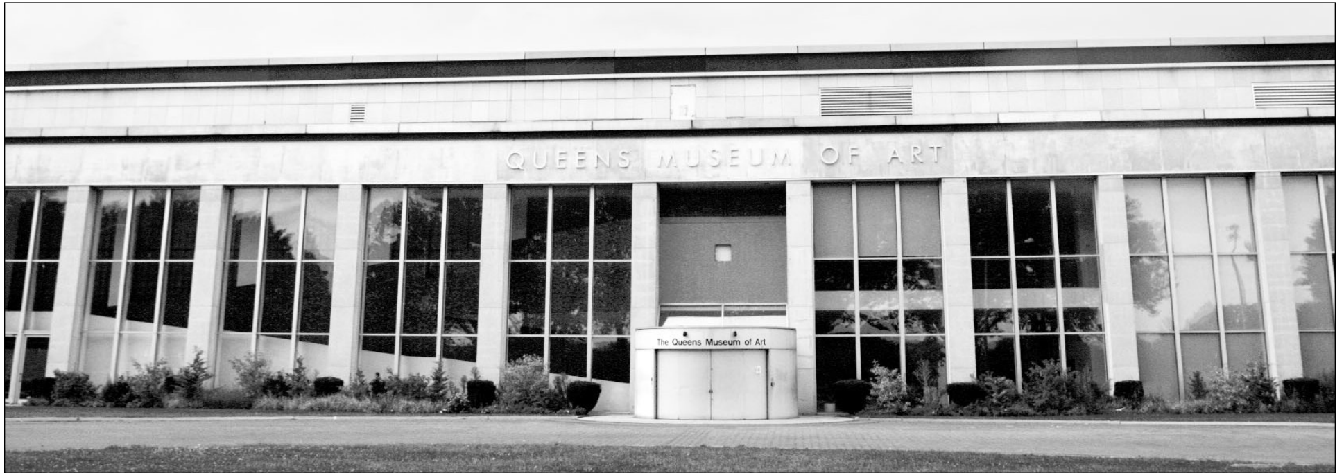
The Queens Museum of Art is a great place to go on a sunny or rainy day.